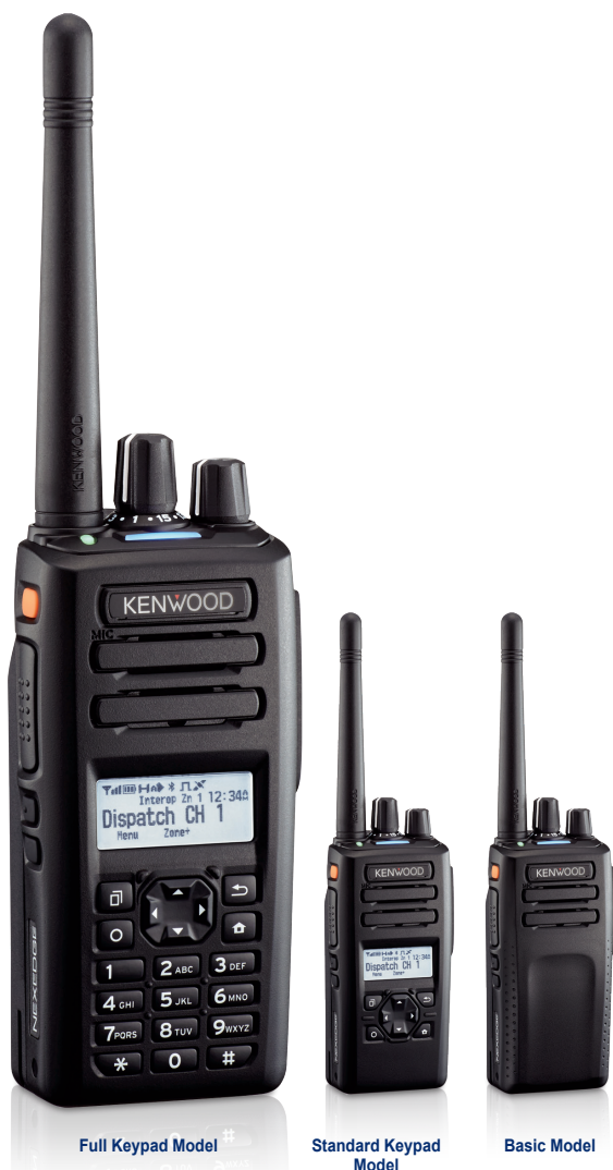
Full Keypad Model

This versatile handheld radio supports both NXDN and DMR digital protocols as well as mixed digital & FM analog operation, enabling it to serve with distinction in a wide range of enterprise- and operation-critical applications. Compact yet designed with durability in mind, it's packed with convenient features like Bluetooth® for hands-free operation and built-in GPS. Three different models with 14-pin Universal connector are available: Full Keypad model with LCD, Standard Keypad model with LCD and a large 4-way D-pad, and the Basic Model without LCD or keypad. Additionally, for expansion capability a software license certification system facilitates extensive customization.